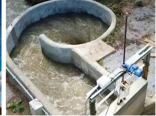
Futura Energy Use