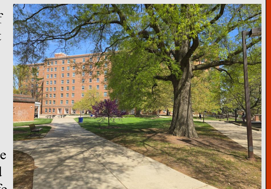
Figure 2 (right): This is an image that I took of the community that shows an example of what I could see. Within the image, you can see infrastructure such as benches, lampposts, trees, buildings, tables, and trash cans.

Another thing that I did was to go into the community itself and to use different senses to see what I could learn from that. For example, using the sense of sight, I was able to see a lot of nature around, plenty of recreational spaces allocated within the community, as well as more basic but non-obvious items such as the lampposts and wide, flat pathways.