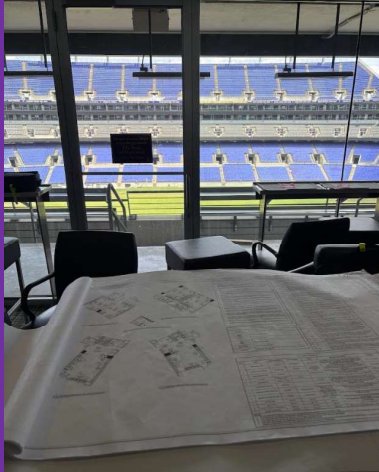
Photo of construction plans for different sky box suites.

Introduction: This past summer, I worked as a Construction Management Intern with Riparius Construction at M&T Bank Stadium, supporting multiple projects including ticketing booths, premium suites, and business offices around the building. My work focused on field coordination, reviewing plans across disciplines, and assisting with scheduling and deliveries.