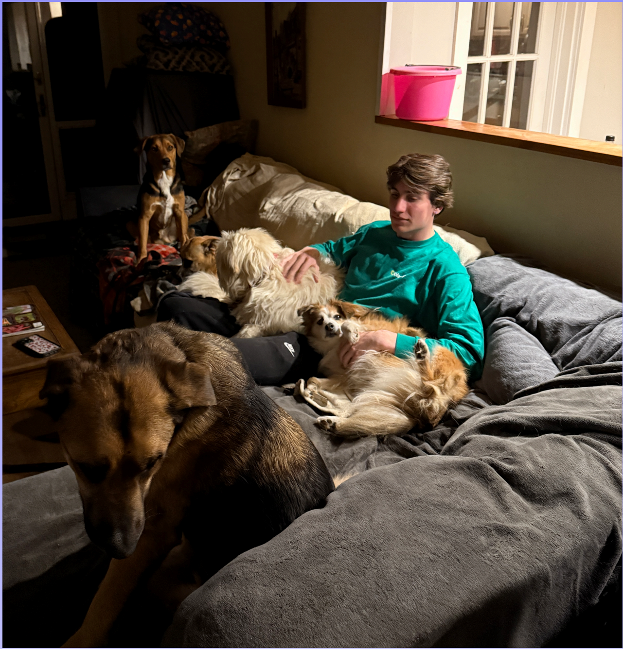
What better way to spend your time than surrounded by dogs!