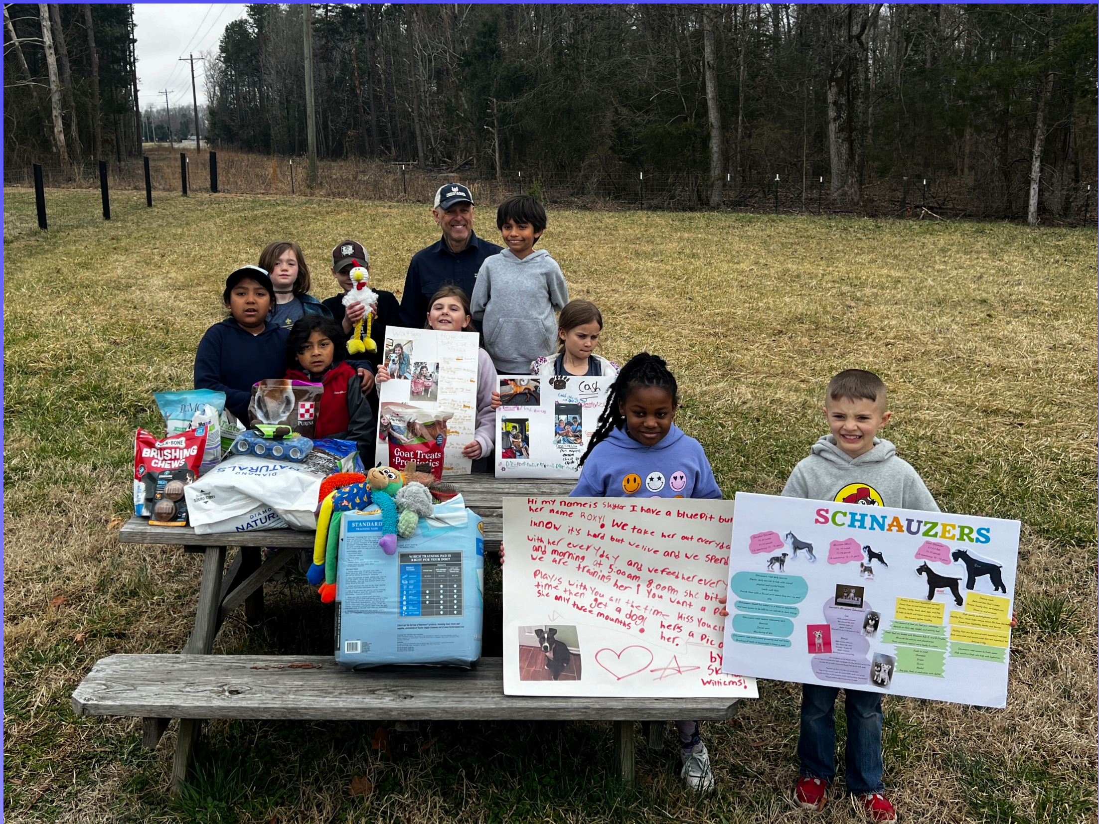
The troop presenting the rescue with donations they accumulated, as well as homemade informative posters for us to keep at the rescue!