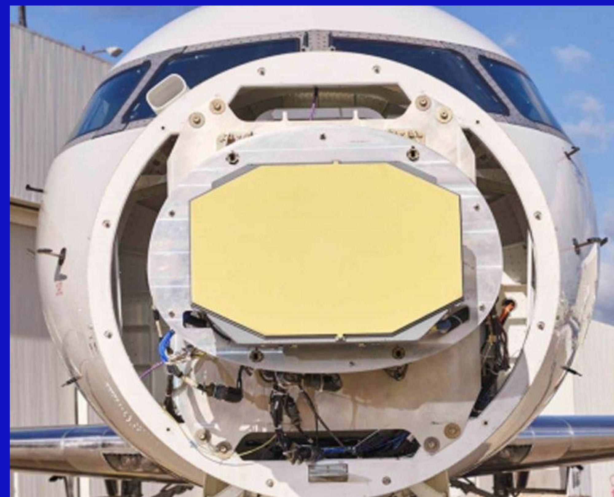
Radar system integrated on plane.

Throughout this internship, I have developed valuable skills that will be applied to my future work. I developed proper and efficient troubleshooting and documentation skills. I am equipped with knowledge of how to develop and write test plans. As well as how to interpret electrical engineering drawings and verify requirements. Also, I now have experience working radar hardware systems and the Matlab interface.