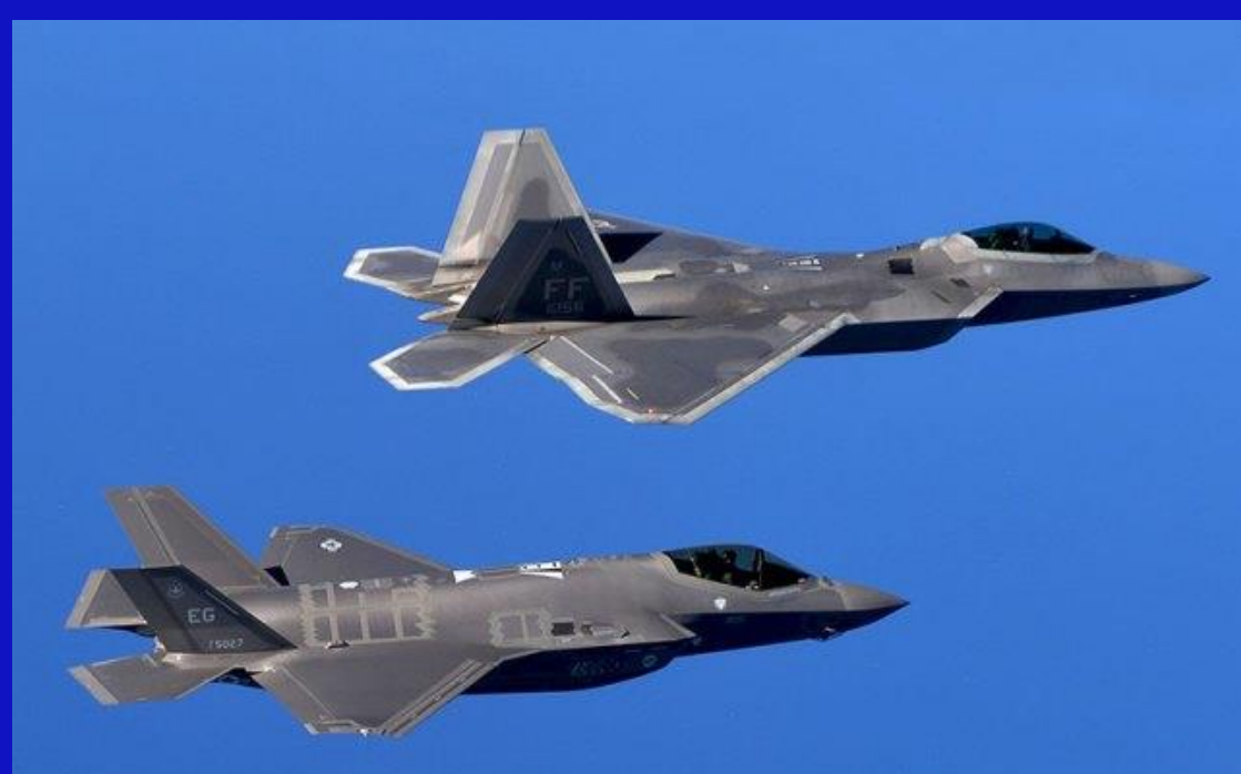
An example of airborne system (F-22) that uses a radar system.

The issues confronting my internship site include, testing radar hardware systems to ensure the, accuracy and efficiency has improved with the new updated technology. Another issue is to design and develop technological advancements that improves the performance of radar hardware in order to maintain global security