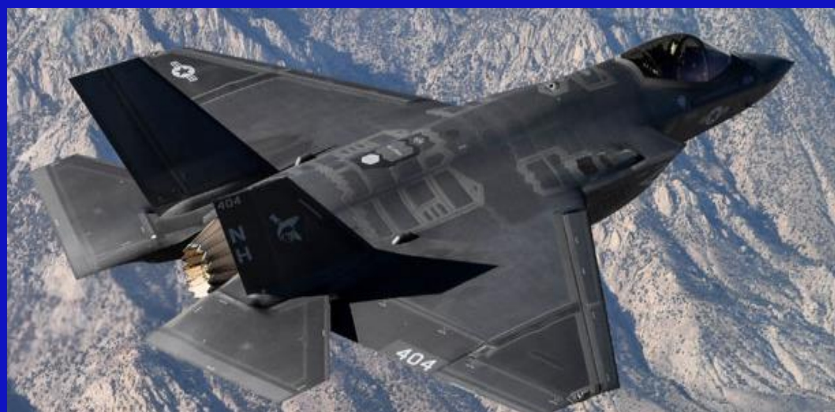
An example of airborne system (F-35) that uses a radar system.

Last semester, Fall 2020, interned at the Northrop Grumman Corporation (NGC) located in Baltimore, MD. As an intern I worked on a ton of projects. Most of the projects related electrical engineering.