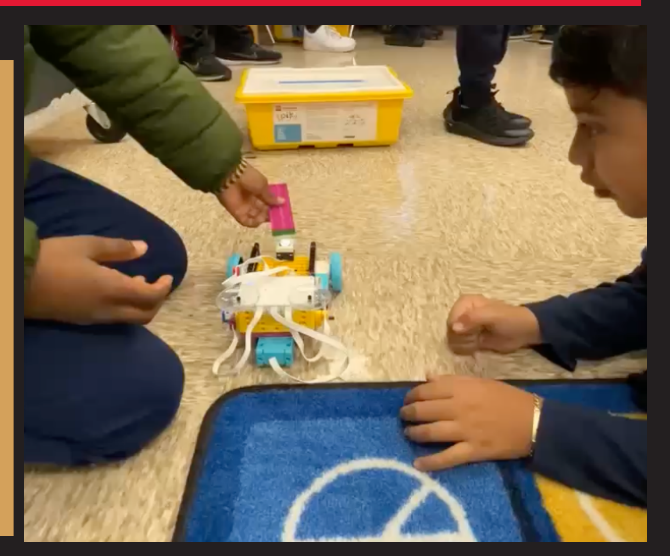
My Students refining and testing their Lego Spike delivery cart during the testing phase of the Grand Challenge.