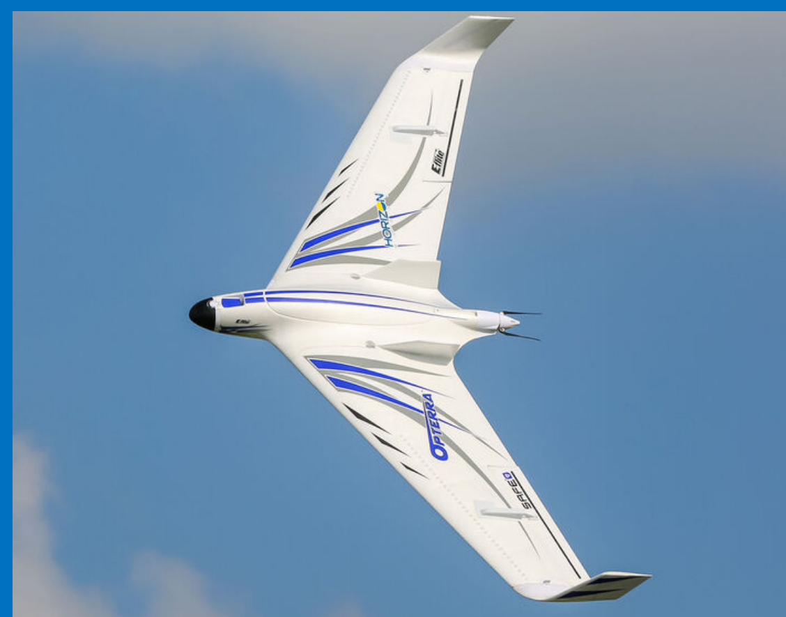
Figure 1: UAS in Flight from Horizon Hobby ( https://www.horizonhobby.com/product/opterra-2m-wing-bnf-basic-with-as3x/EFL11150.html )

Mission Planner is a ground control station (GCS) software that communicates with the UAS, the Opterra (Figure 1), and autopilot via wireless telemetry through an RFD900 radio link. Mission Planner was used to setup the autonomous flight by configuring the autopilot, setting parameters, and establishing a mission of waypoints that the Opterra would fly autonomously. The autopilot utilized was the Cube Orange Flight Controller (Figure 3), which would load the parameter and waypoint files to tell the Opterra what to do. The internship consisted of three main categories: programming, construction, and flight of UAS, all of which were incorporated into the final mission assignment.