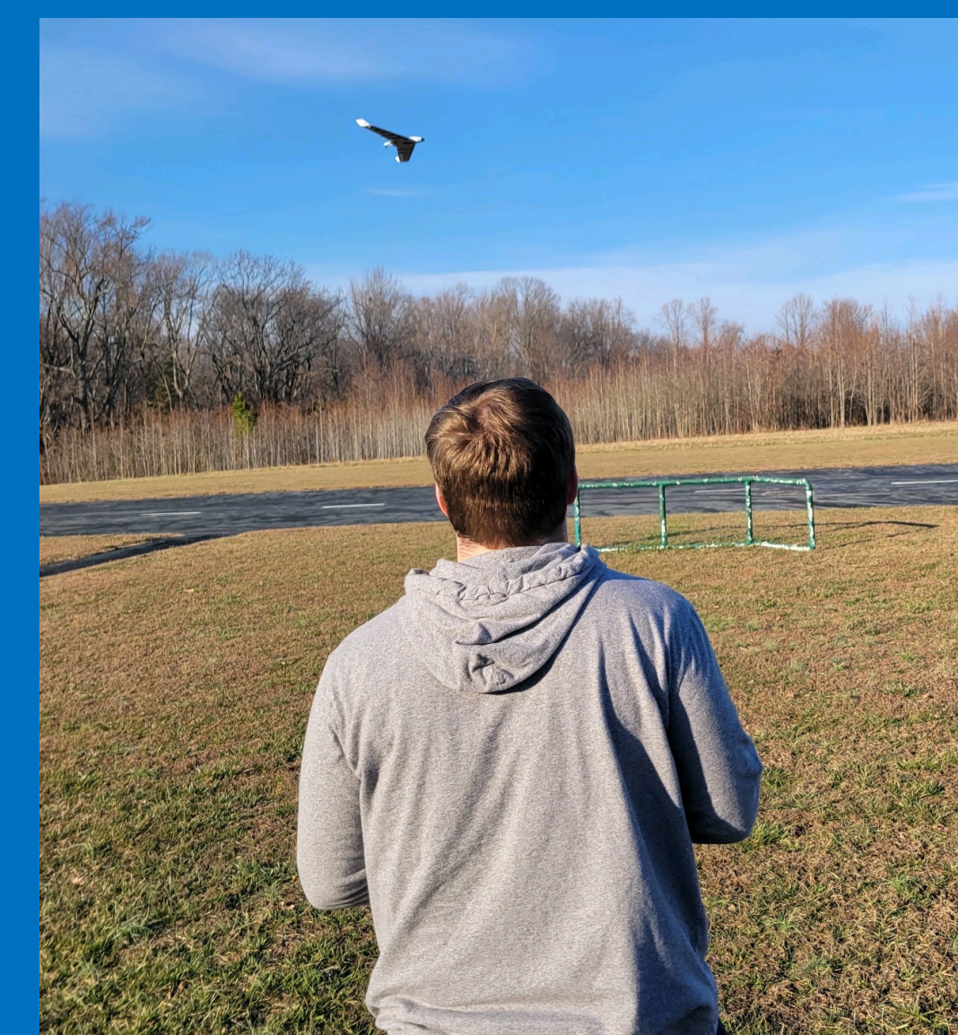
Figure 4: Me flying the Opterra in the Auto and Stabilize flight modes at Patuxent Aeromodelers RC Club, testing out Mission 2.