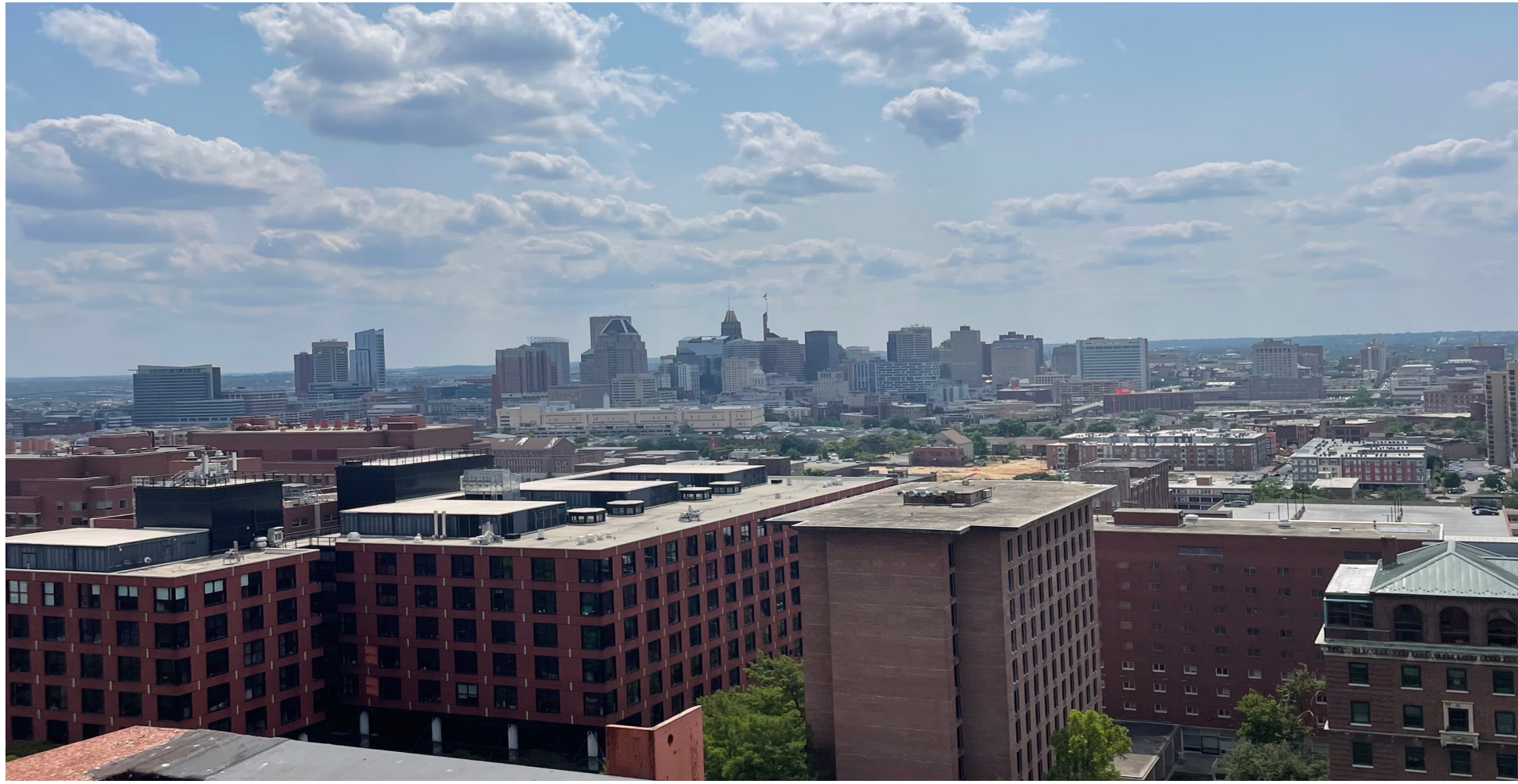
Downtown Baltimore from the top of the South Tower

College Park Scholars - Science and Global Change | CPSP 359G | Civil Engineering College Park Scholars Academic Showcase, May 3, 2024