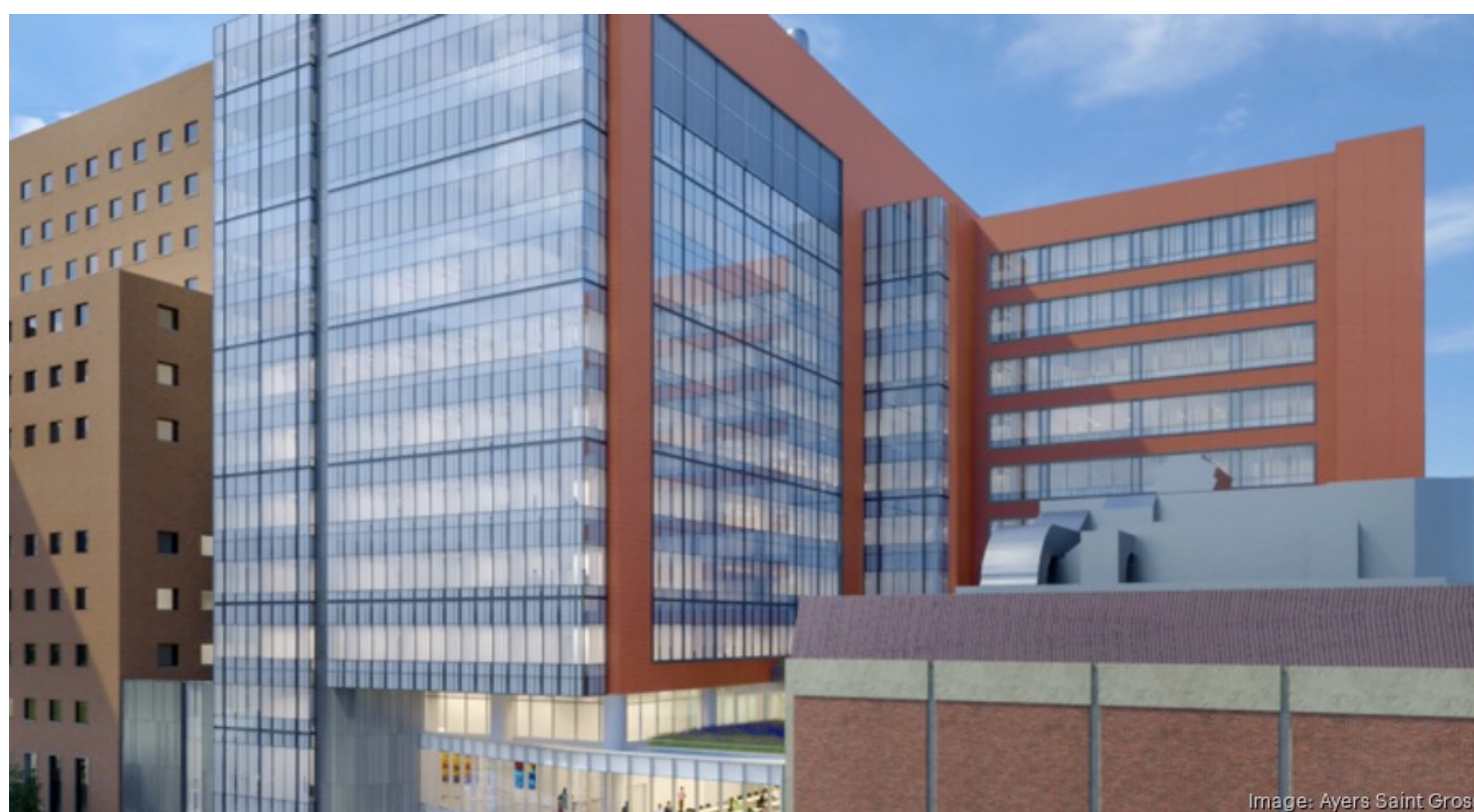
A 3D rendering of the north and west towers done by the architects at Ayers Saint Gross