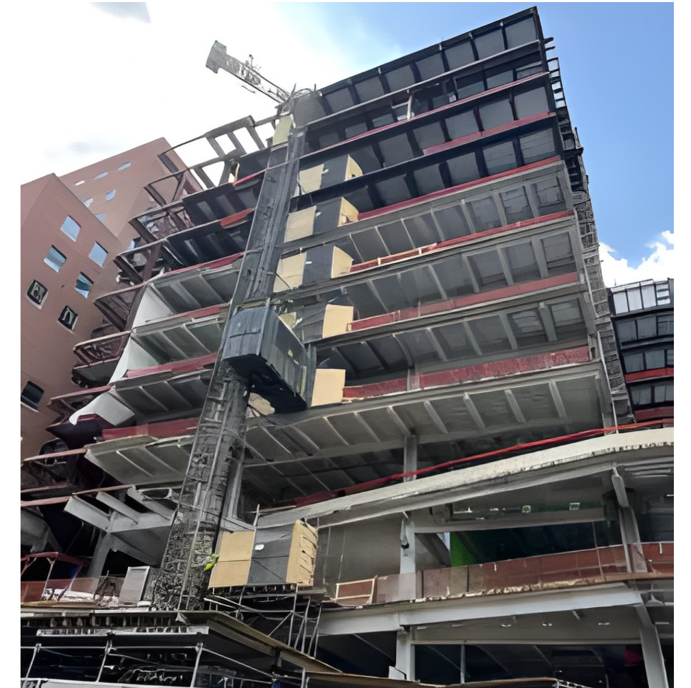
North tower being topped out

During the summer and winter of 2023, I had a Project Engineer internship with Whiting-Turner. I was placed at a site in East Baltimore, Maryland on the Interior finishings team. I worked directly on the CMSC renovation and North Tower addition of the Johns Hopkins Hospital main campus.