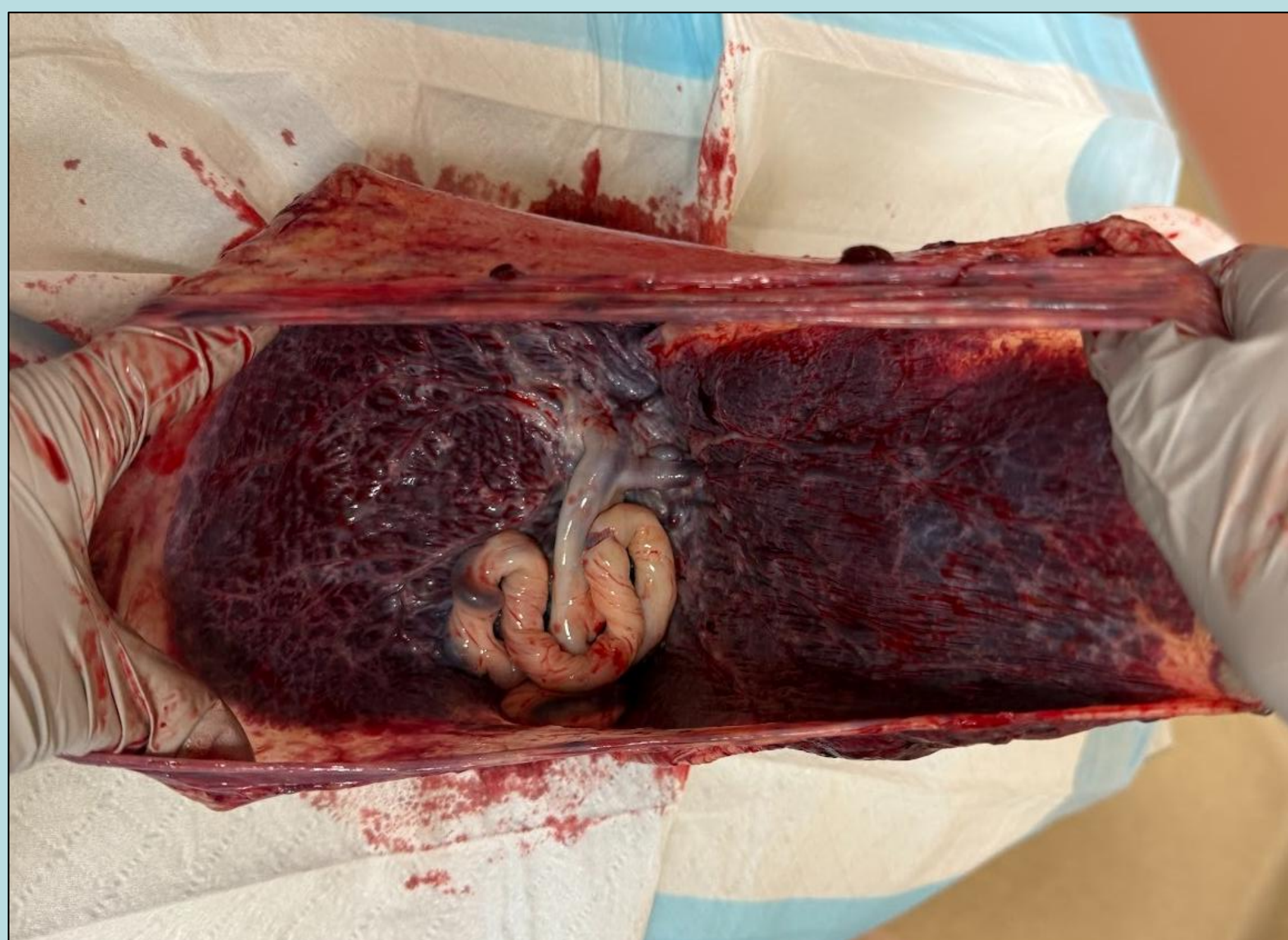
Placenta from a Cesarean section for a baby born August 21 st , 2025, approx. five minutes postpartum. Visible sack and umbilical cord. Rough side and smooth side.