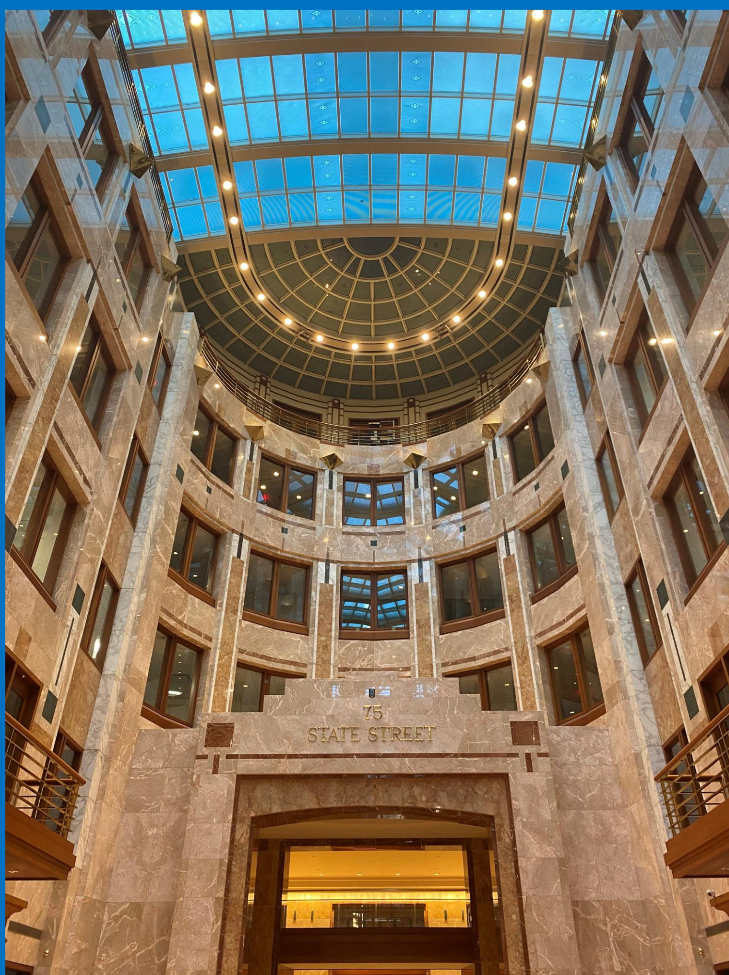
My Office Building Main Entrance