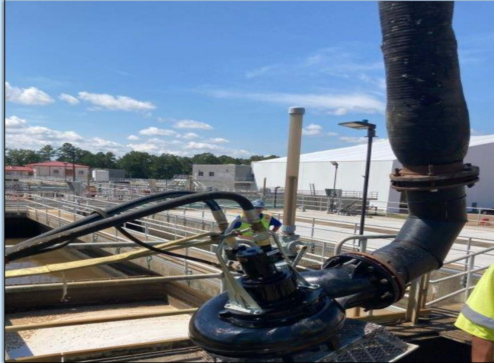
Emergency pump installed at O.B. Curtis Treatment Plant in response to the flash flood