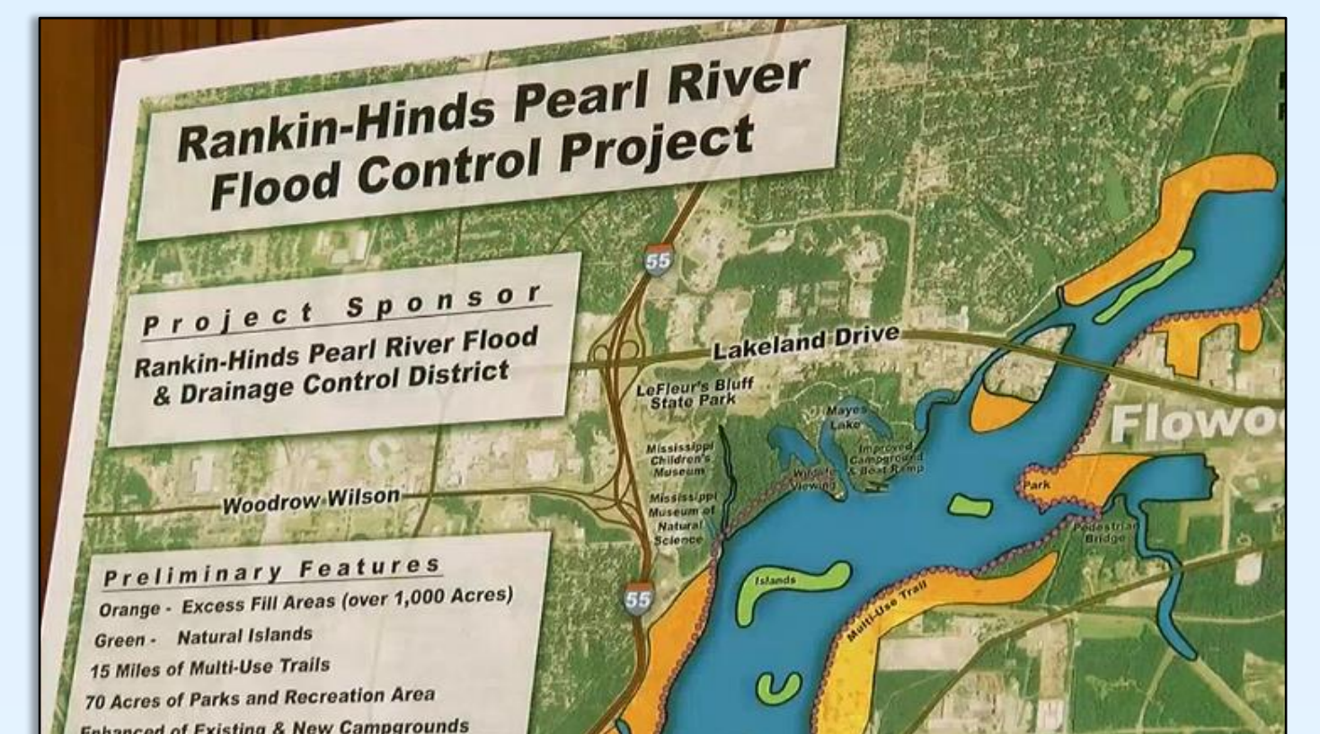
Diagram Outlining Proposed Lake One Project

Recently, the U.S. Army Corps of Engineers and Jackson officials discussed plans of revitalizing the 2007 Lake One project, which plans to build a 1,500 acre lake on the Pearl River. The lake would be accompanied by newly-constructed waterfront property. Experts claim that this project would move water downstream the Pearl which would significantly reduce future heavy flooding. Arguments from local environmentalists however suggest that it would have an inverse effect and destroy local ecosystems and aquatic habitats. If the plan goes into effect, I would like to conduct research on its development.