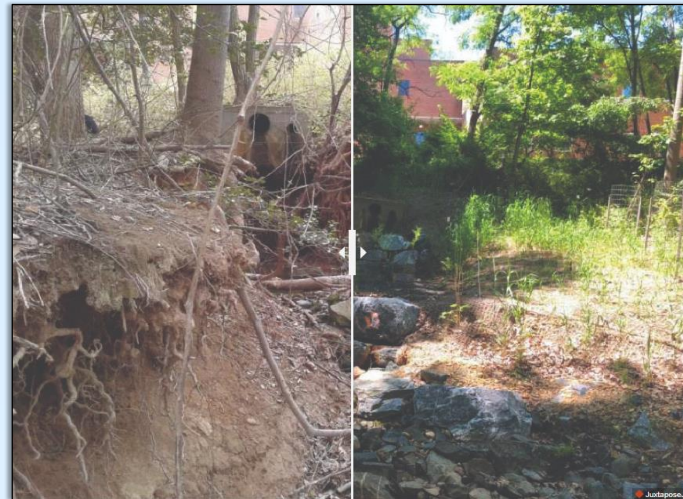
Before & After Pictures of RSC technique on campus creek.

Goals: While taking the class, I planned to make meaning of the societal significance of several infrastructure systems and analyze the sociopolitical relationships that influence their existence.