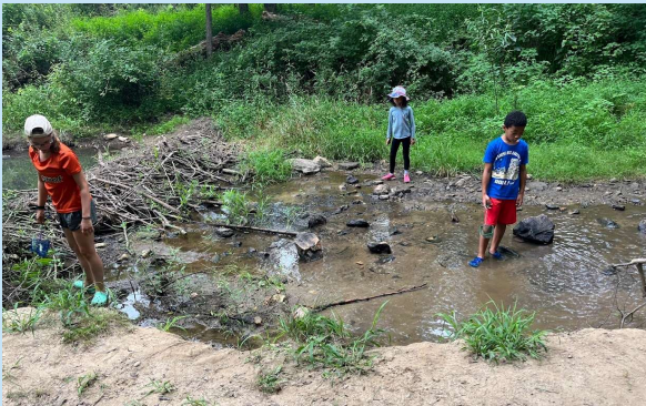
Kids are looking for macroinvertebrates like crayfish in the stream. They learn about stream health and biota through this lesson.

Over the summer of 2022, I worked as an Environmental Education Intern at the Howard County Conservancy. The Conservancy hosts environmental summer camps for kids aged 5-12.