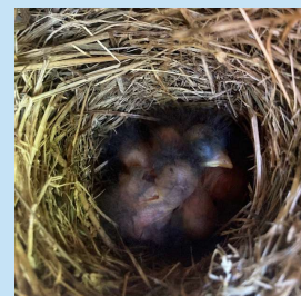
On the left, are baby bluebirds spotted in one of the birdboxes on the Conservancy grounds.

Kids can get hands on experience out in nature due to camps like these. We need to continue these types of environmental camps and even make them more accessible to everyone because they bring unique knowledge not experienced anywhere else.