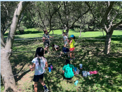
Kids are playing a game to learn about spiders and spider webs

Goals: To provide an environmental education to kids, in order to spark their interest in loving and protecting nature.