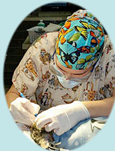
A veterinary technician performing a dental cleaning on a cat at the Andover Animal Hospital