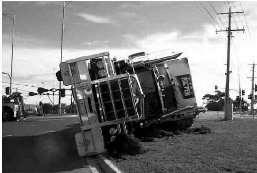
FIGURE 1 Post-crash fire and rollover crash.