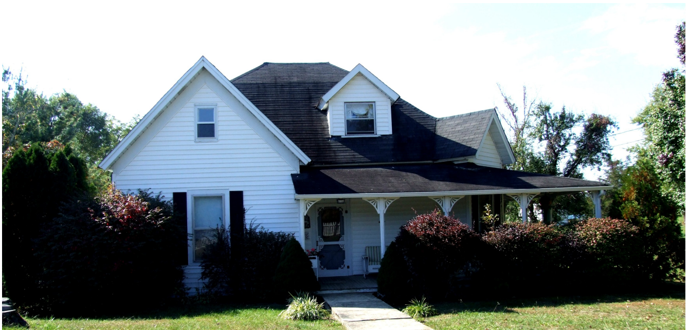
Brown Cottage 2008