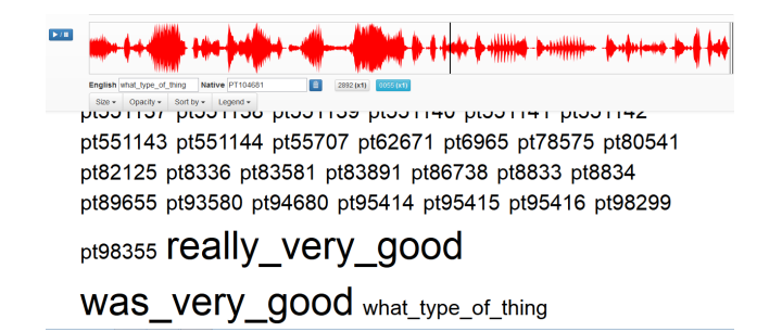
Figure 2: Using VaporEngine to explore a response.

VaporEngine's term-centric view, waveforms for several occurrences of the term are displayed and the user can play those examples in quick succession. As each occurrence plays, the link to the response in which the term was found is highlighted. Following a link shows the corresponding response-centric view. Text entry fields are available in either view for a user to provide an English gloss translation for the term. In the response-centric view shown in Figure 2, a term cloud is shown, where each term initially has a generic identifier (e.g., "pt8834"), sized by the term frequency in the response. As English gloss translations are provided by the user, generic identifiers are replaced with the corresponding English term, both in this term cloud and in term clouds for every other response. Thus, as the user annotates terms, the generic clouds progressively transform into English term clouds. In this way, the response-centric view supports efficient collection browsing with a relatively modest annotation effort.